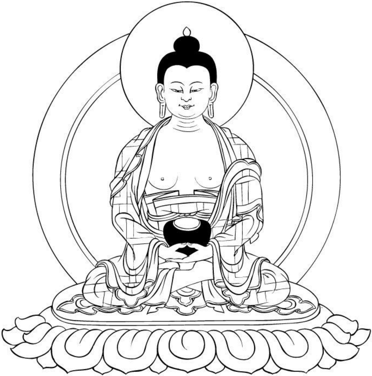
This is the Buddha Amitabha, the Buddha of the western direction and setting Sun, related to death, dying, and the bardo states. He has both hands in meditation pose and holds a begging bowl. Please treat this image with respect.